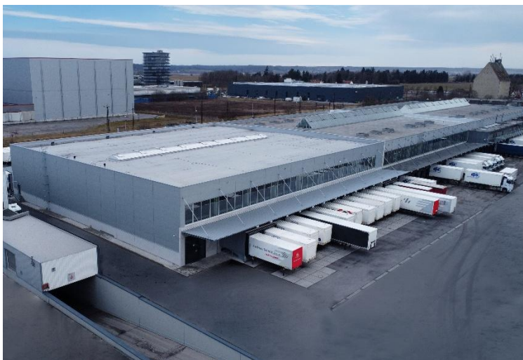
Picture 1: With an area of 11,500 m 2 , the Andreas Schmid Group's logistics hall is one of the largest terminals in southern Germany.

Schledorn emphasizes: "The terminal is unique in Southern Germany in terms of size, modernity and the professionalism of its operations. In particular, the company's strong position in the German groupage market and the international growth opportunities created by the new facility were key factors in my decision to take on this role."